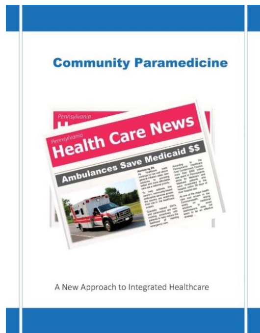
Community Paramedicine Whitepaper

Pennsylvania is fortunate to have several MIH programs, all of which are different somewhat different in their scope of services based on the aforementioned community needs assessment. These programs operate in communities that span the Commonwealth and provide the task force with valuable real-world experience that will help to shape the future of mobile integrated healthcare in the Commonwealth.