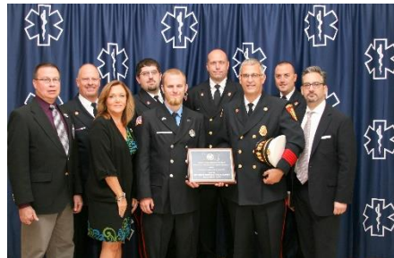
Garden Spot Fire Rescue Region: EHS Federation