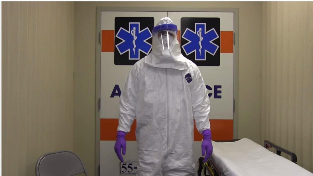
Donning and Doffing Ebola PPE for EMS - Coverall Version

With the proliferation of Ebola in West Africa and the possibility of introducing the disease into the United States by international travelers, including returning aid workers, the Centers for Disease Control and Prevention (CDC) mobilized to create guidance for EMS providers. This advice included surveillance information, signs and symptoms, and specific recommendations for the use of personal protective equipment (PPE).