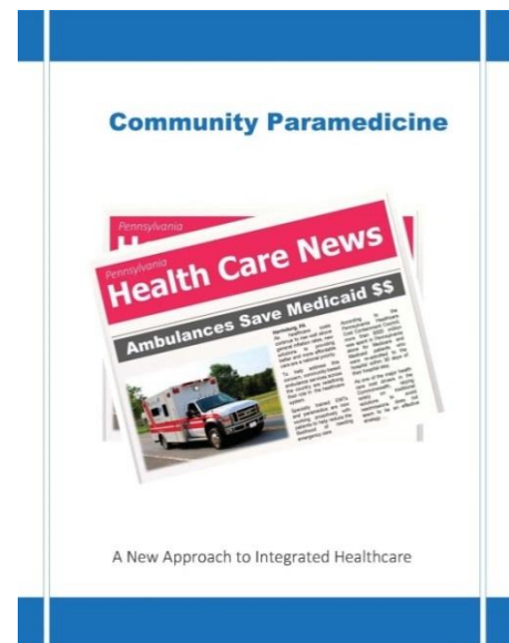
Community Paramedicine Whitepaper

During FY 13-14, the task force focused on defining a vision for community paramedicine in Pennsylvania by producing a whitepaper, "Community Paramedicine, A New Approach to Integrated Healthcare". In FY 14-15, the task force continued to educate the public and members of the general assembly on the benefits of this emerging area of EMS practice. The task force also embarked on what it sees as the next phase of development for community paramedicine: establishing minimum education standards for providers and minimum licensing standards for agencies. Although specific community initiatives are based on a local needs assessment, the task force will identify foundational educational objectives essential for all community paramedics.