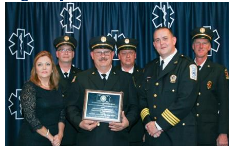
Greenfield Township VFC Region: EMMCO West