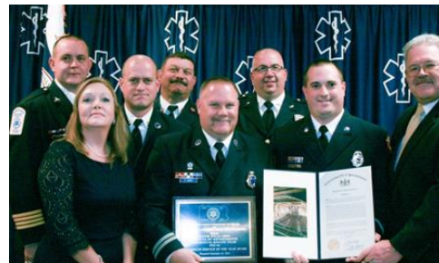
South Hills Area Cooperative of Governments, Technical Response Team (SHACOG) Region: EMSI