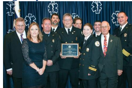
Burholme EMS Region: Philadelphia