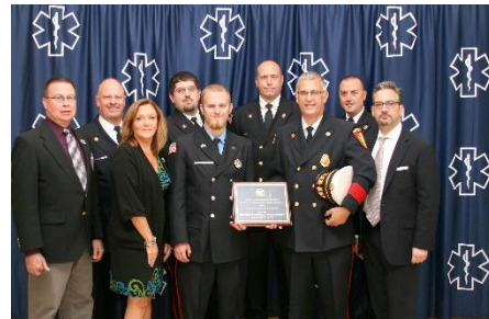
Garden Spot Fire Rescue Region: EHS Federation