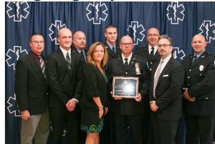
Baldwin EMS Region: EMS Institute