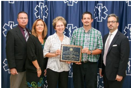
Lack Tuscarora EMS Region: Seven Mountains