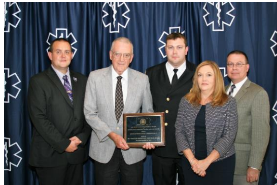
Mifflintown Hose Company No. 1 Region: Seven Mountains