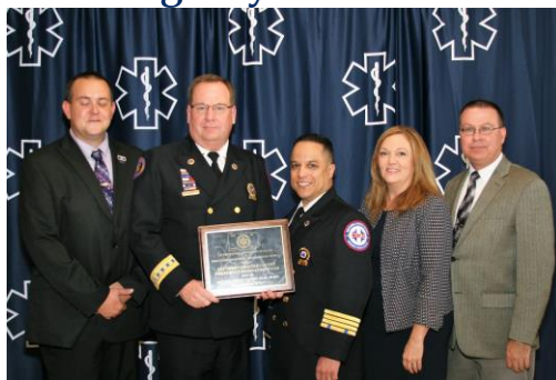
Southern Chester County EMS Region: Chester County