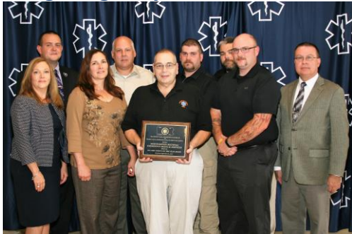
Northampton Regional EMS Region: Eastern PA