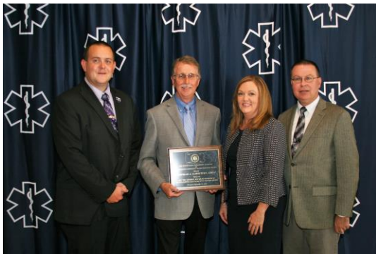
Douglas Garretson Center for Emergency Medicine Region: EMS West